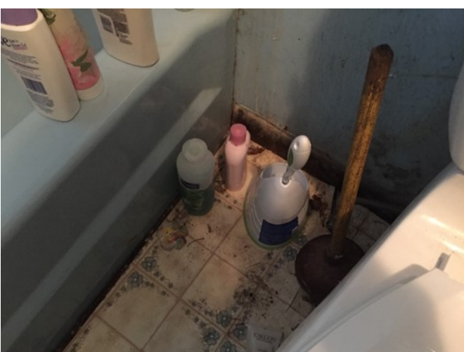
Figure 1. Mold on caulk & baseboards in a damp bathroom.

What is not made clear on the internet or in mold testing reports is that these mycotoxins are not usually present in mold spores (remember, they are secondary metabolites produced when a mold is growing). They also are not "spritzed" out of mold growth like perfume so they do not become airborne. To ingest a mycotoxin, a person usually must breathe in large amounts of mold particles (see PPE below) or actually eat it. Some of the worst cases of foodborne illness in history have been associated with aflatoxin, a common fungal mycotoxin (12). The physiological basis for the "hysteria" of the Salem witchcraft trials may have been ergotism, caused by the ingestion of rye grain contaminated by Claviceps purpurea (13). And many instances of gastroenteritis have been associated with eating moldy foods (14). So, TAKE HOME MESSAGES NUMBER THREE & FOUR - Mycotoxins are not always present and are never released as a gas. Don't eat moldy bread or moldy building materials.