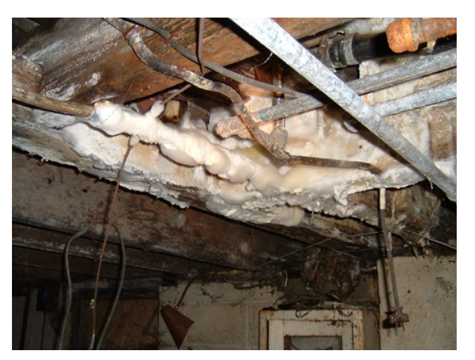
Figure 2. Frozen plumbing and mold growth on floor joists. Note, some of the mold growth is white.