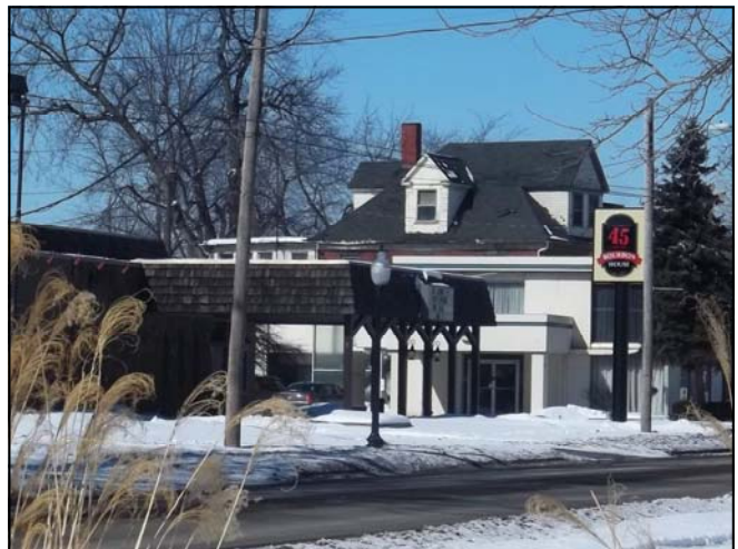
Bourbon House 45 Restaurant in Rehabilitated Building

Four hundred and seventy-six (487) general, electrical, H.V.A.C., plumbing and demolition contractors were registered to work in the City of Warren in 2014. The resulting registration fees brought $61,250 into the general fund.