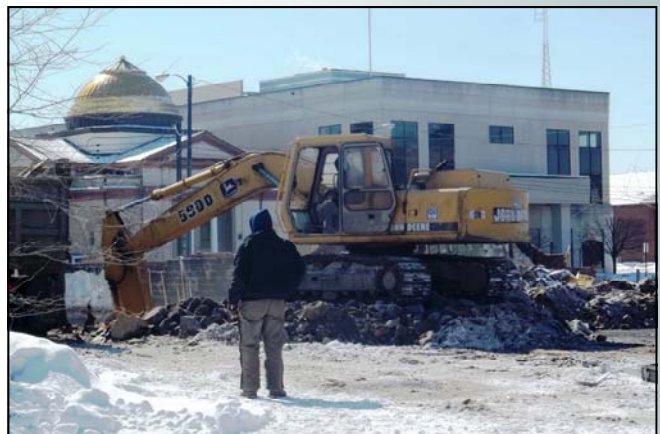
Building on East Market Street Demolished

If nothing has been agreed upon by the owners and this department and time limitations have run out, legal and civil action is pursued to abate the unsafe conditions.