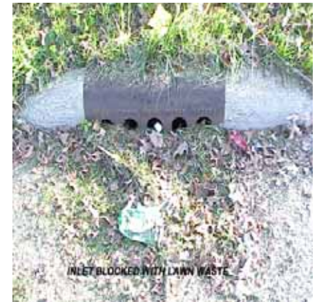
INLET BLOCKED WITH LAWN WASTE