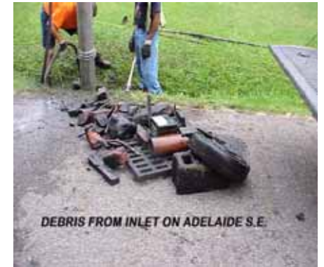
DEBRIS FROM INLET ON ADELAIDE S.E.