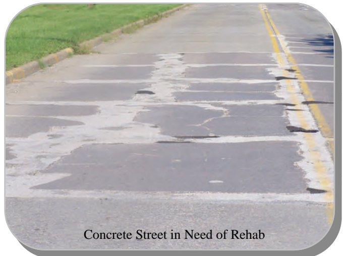
Concrete Street in Need of Rehab

To assist the funding of the above proposal and other capital street improvement needs, I would recommend that Council pass the one (1) remaining five dollar ($5.00) license plate tax. This would be used for street capital improvements only, no salaries would be paid from these funds.