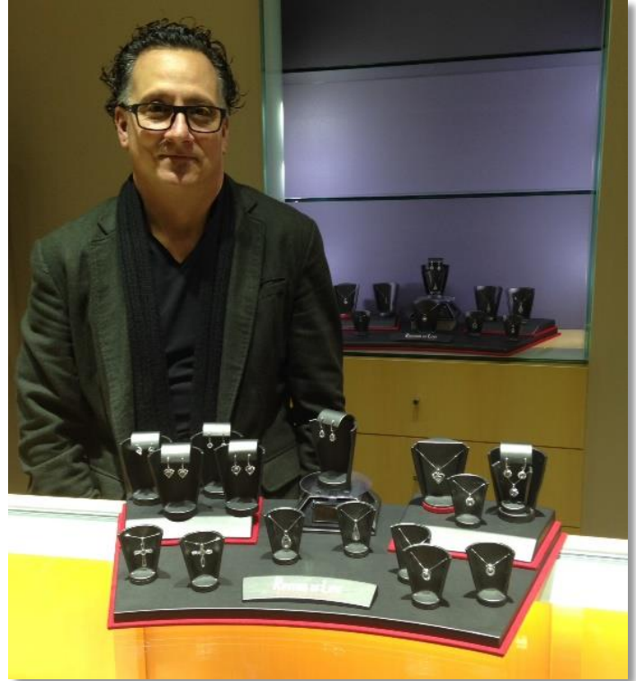
USA MADE SHINOLA WATCHES AND "RHYTHM OF LOVE" JEWELRY MAKE A PERFECT GIFT