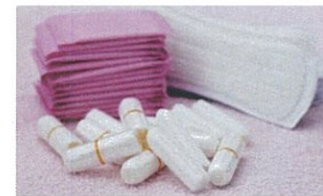
Tampons and Pads